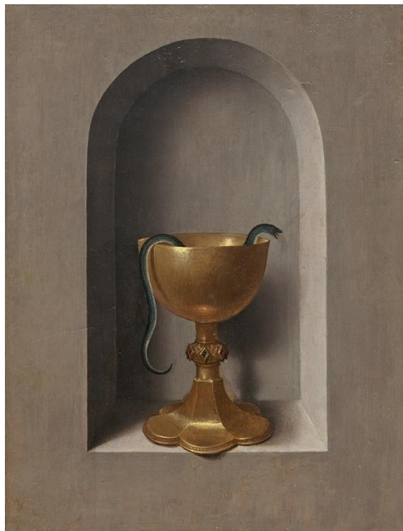
“Chalice of Saint John the Evangelist” by Hans Memling, circa 1470-1475

Pastor’s phone: 760-679-3699 Pastor’s email: pastor@gracelutheranelcentro.org