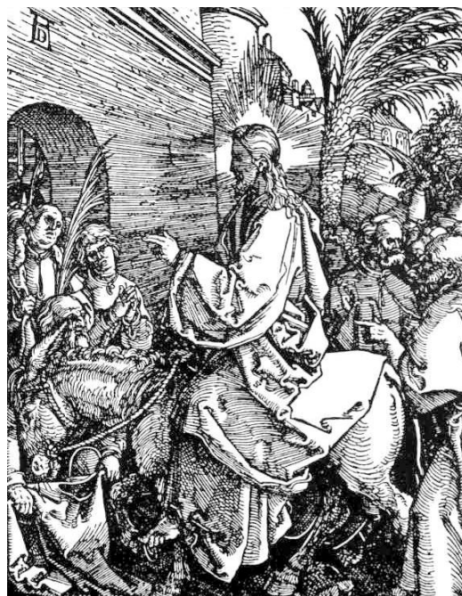
“Christ’s Entry into Jerusalem” by Albrecht Dürer, 1511, Public Domain

Pastor’s email: pastor@gracelutheranelcentro.org