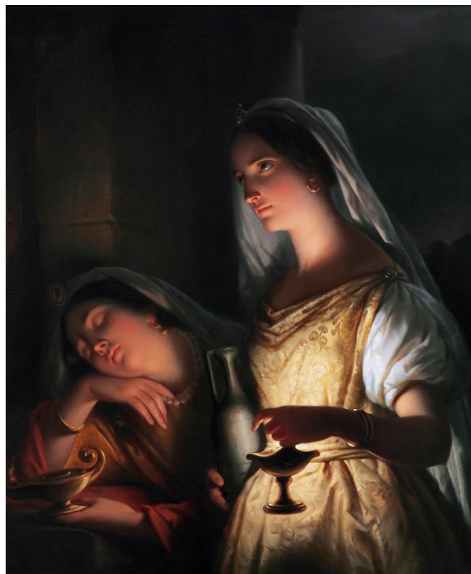
The Wise and Foolish Virgin by Jan Adam Kruseman, 1848

Therefore, as we await His coming, wisdom directs us “to the dealers” (Matt. 25:9), that is, to the ministers of His Gospel. Thus we wait upon the Lord, and we “encourage one another with these words” (1 Thessalonians 4:18). Waking or sleeping, we are prepared to meet Him when He comes “with a cry of command, with the voice of an archangel, and with the sound of the trumpet of God,” and “we will always be with the Lord” (1 Thessalonians 4:16, 17).